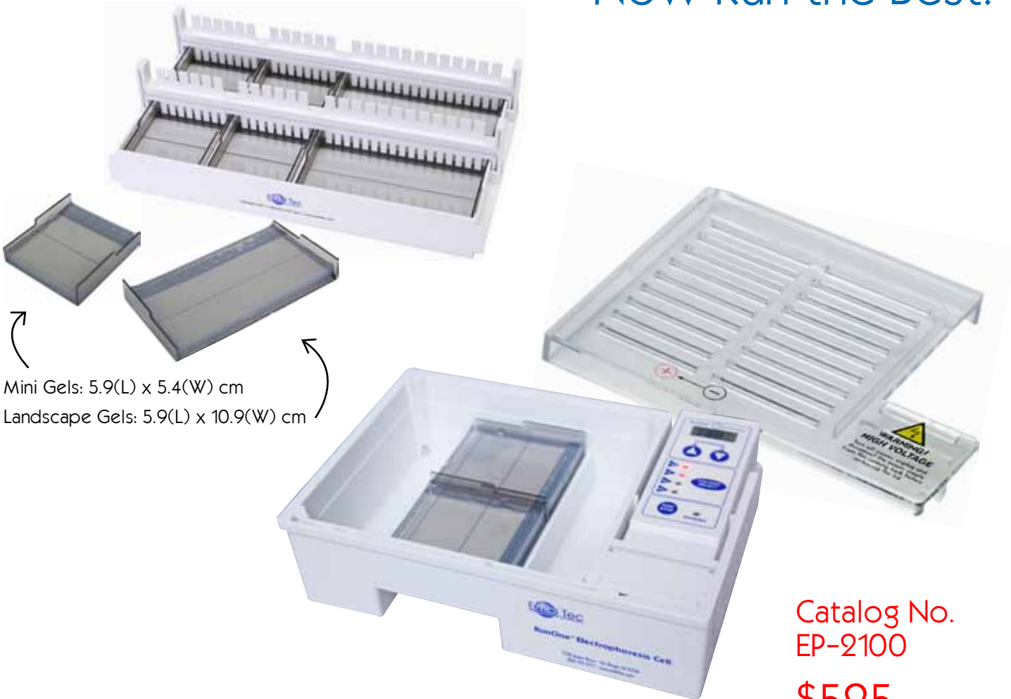
Mini Gels: 5.9(L) x 5.4(W) cm Landscape Gels: 5.9(L) x 10.9(W) cm